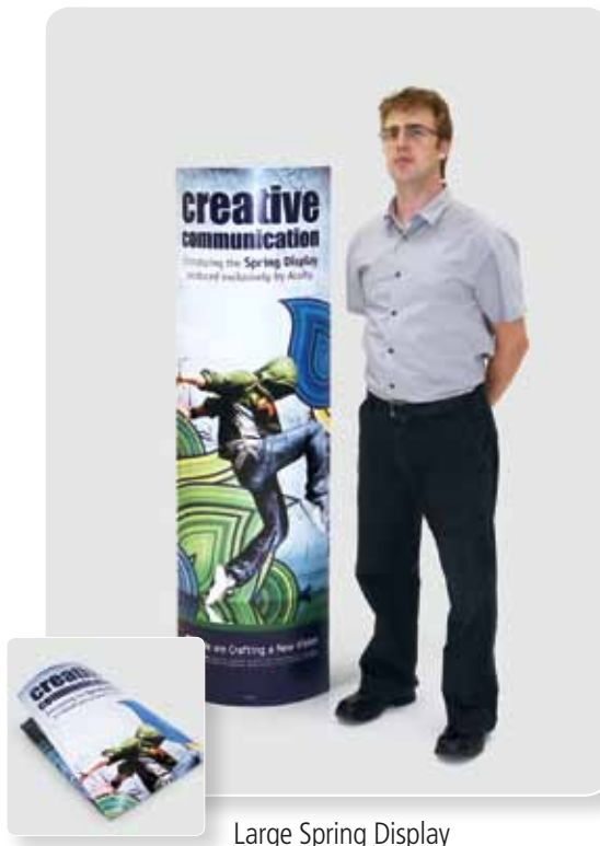
Large Spring Display