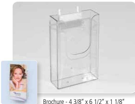
Brochure - 4 3/8" x 6 1/2" x 1 1/8"

Need to showcase marketing collateral? Spring Display Holders easily clip onto displays and wraps to carry business cards, sell sheets and brochure holders. Made from a durable, clear plastic. Spring Display Holders are perfect for POP, trade shows and events.