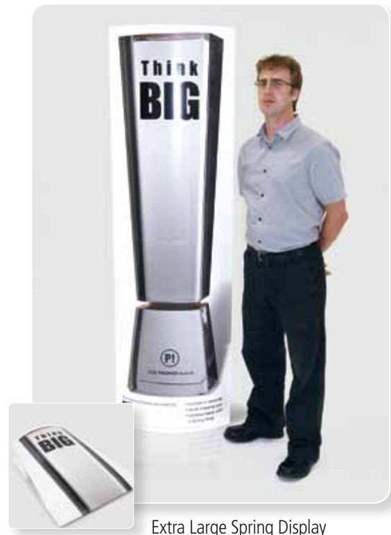
Extra Large Spring Display