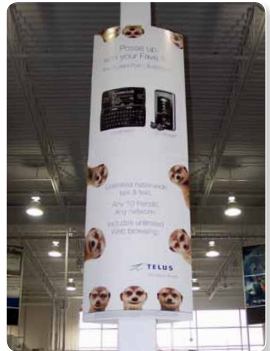
Leverage unused advertising space attaching Spring Pillar Displays to pillars, poles, support beams, and security panels. Hangs in seconds using magnets.