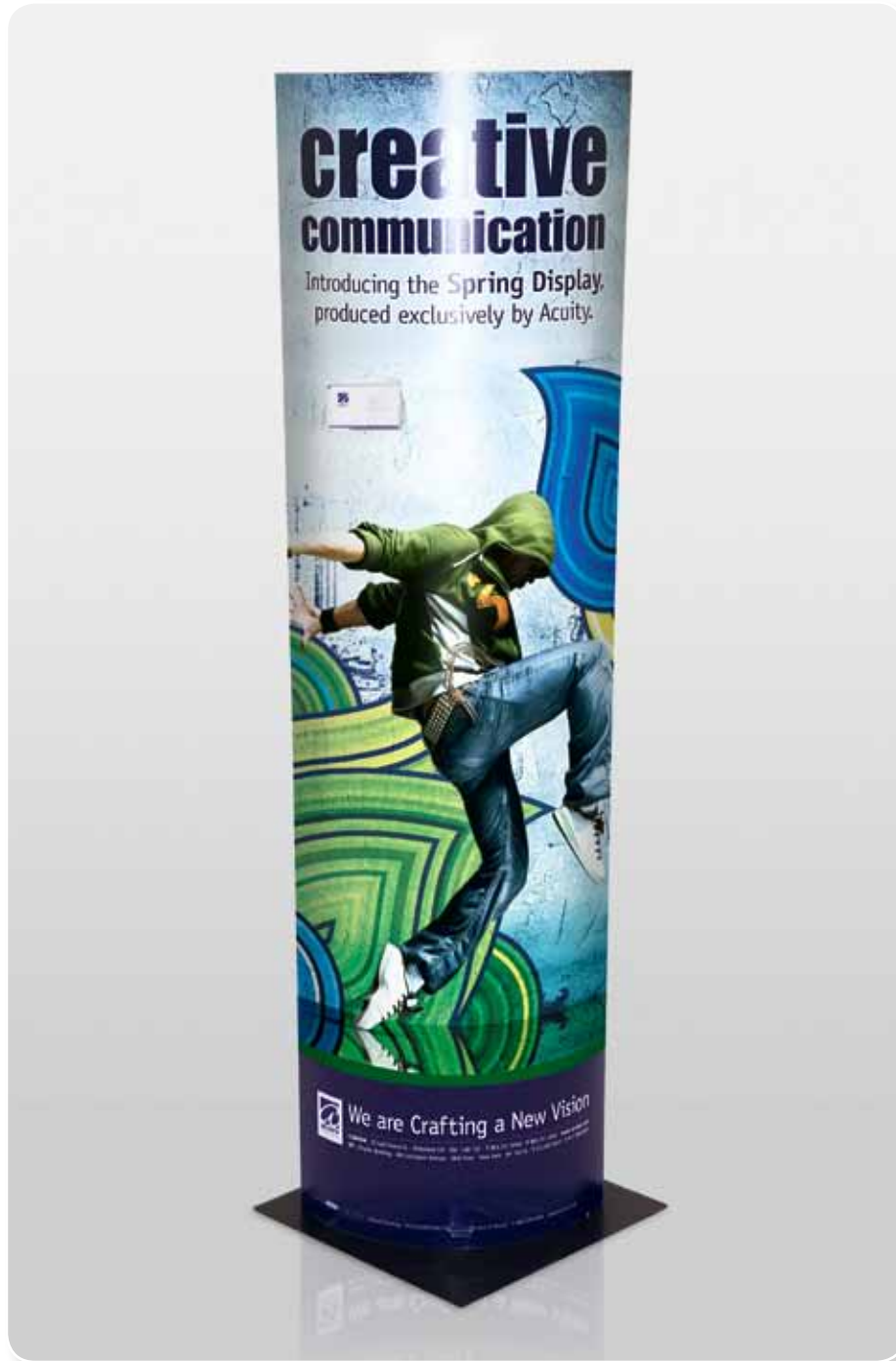
Large Spring Display - 20.5" x 60"

Introducing Spring Displays, an innovative, self-standing promotional print product. Developed with a patented technology, Spring Displays automatically pop open and set up in seconds. Its small shipping size, durability and portability make the Spring Display a perfect compliment for in-store promotions.