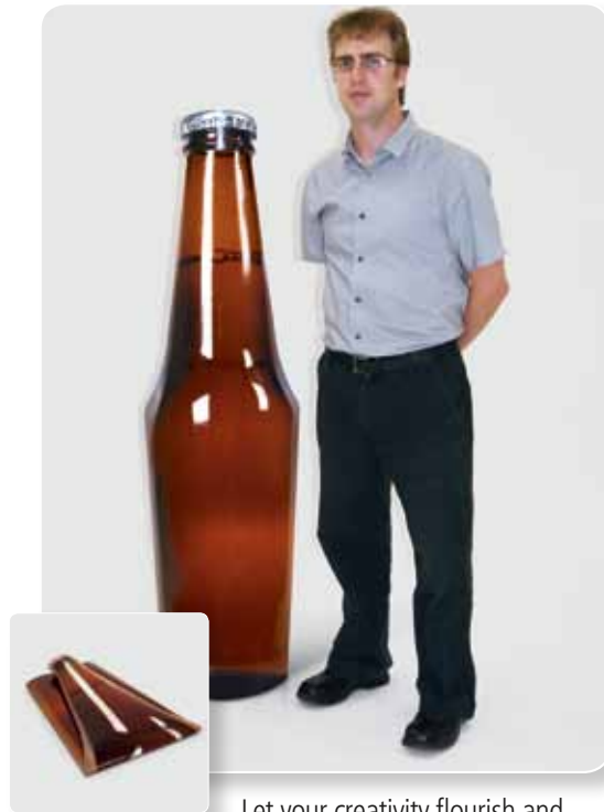
Let your creativity flourish and create a custom Spring Display. Contact us to get started designing a captivating custom display.