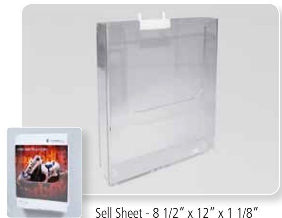
Sell Sheet - 8 1/2" x 12" x 1 1/8"