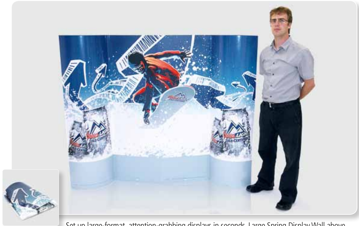
Set up large-format, attention-grabbing displays in seconds. Large Spring Display Wall above.