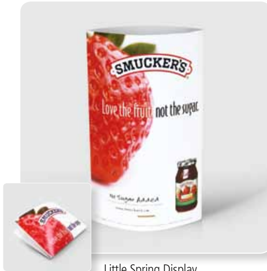
Little Spring Display