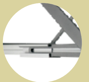
Safety lock slider keeps Standup straight and sturdy all the time