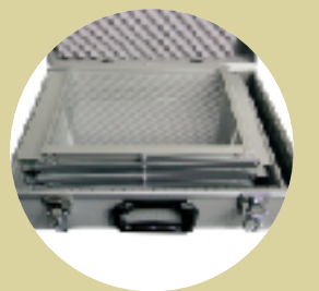
Packs neatly into a single durable aluminum case