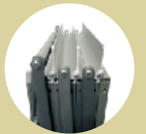
Compact and lightweight for easy transportation