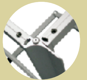
Constructed from high-grade aluminum with titanium finish