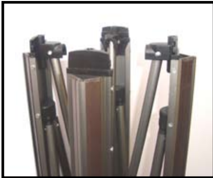
SQUARE SATELLITE MID FRAME With Plain Hubs on Top