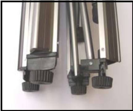
SQUARE SATELLITE BOTTOM FRAME With Adjustable Feet on Bottom