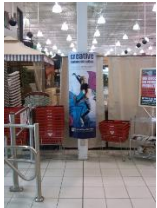
Pillar Displays at any height