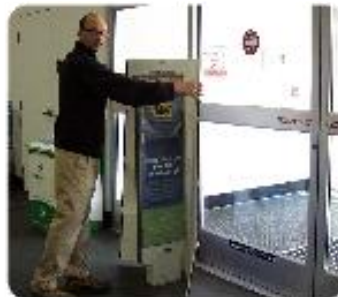
Easy to install.