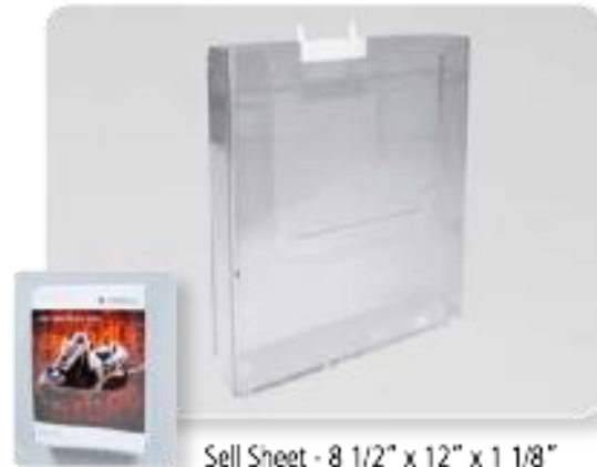
Sell Sheet - 8 1/2" x 12" x 1 1/8"