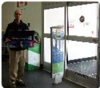
Easy to ship.