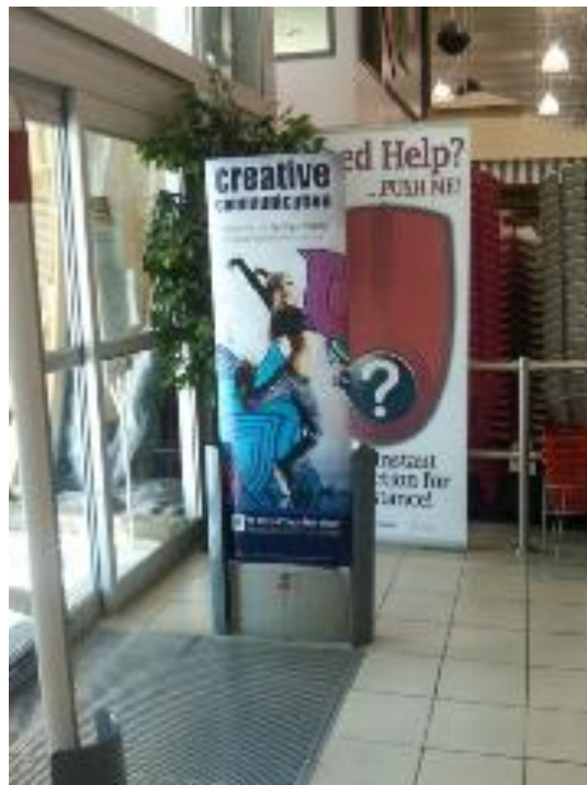
Security System Displays