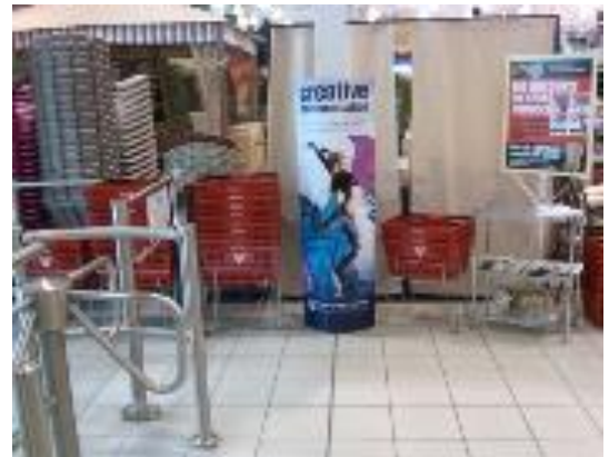
Automatic Displays can be used anywhere in the store