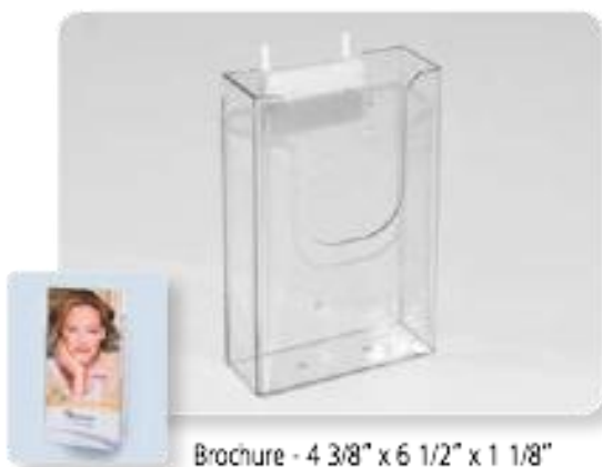
Brochure - 4 3/8" x 6 1/2" x 1 1/8"

Need to showcase marketing collateral? AD-1 Holders easily clip onto displays and wraps to carry business cards, sell sheets and brochure holders. Made from a durable, clear plastic, AD-1 Holders are perfect for POP, trade shows and events.