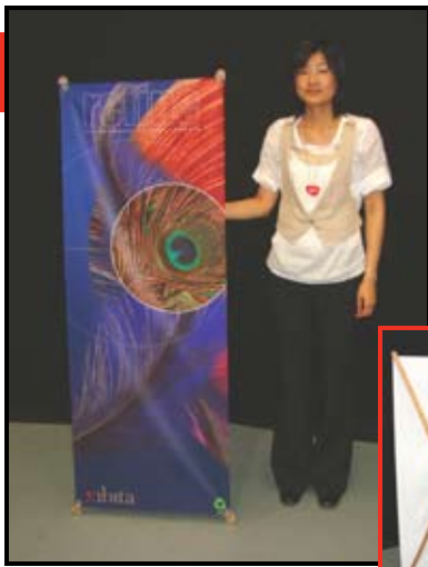
Assembled Bamboo Banner