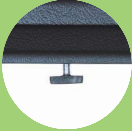
Adjustable feet for uneven surfaces and extra clearance