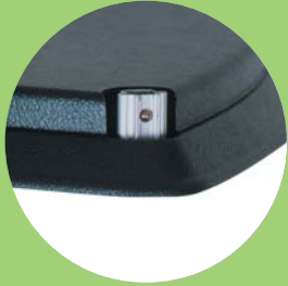
Snap-lock metal joints for long-lasting strength and rigidity