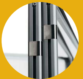
Patented 360° hinges allow for unlimited configurations