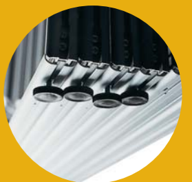
Adjustable feet for uneven surfaces and extra clearance