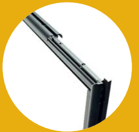
Slider and twin channels allow you to instantly replace front and back panels

A display that rises to the occasion. The Original 8 is fast on its feet on virtually any surface! The system has adjustable feet that allow your display to be steadied properly on uneven show floors. The easily adjustable feet also give extra clearance at the bottom of the display should light or extension cords need to pass underneath.