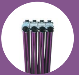
Compact, lightweight system expands into a full visual display