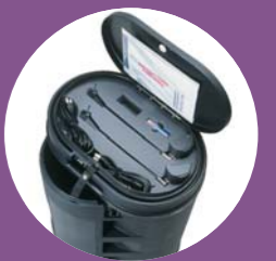
Entire display fits neatly into a single All-In-One Case