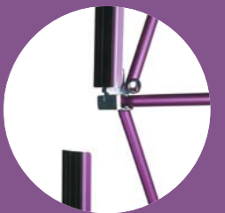
Polarized magnetic strips for seamless precision